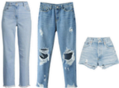
No jeans, pants, or shorts with rips, frayed hems (or edges), or holes. Bottoms can be no shorter than three (3) inches above the knee.