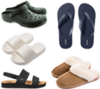
No open toed shoes. No slippers or similar footwear such as Crocs or shoes without backs.