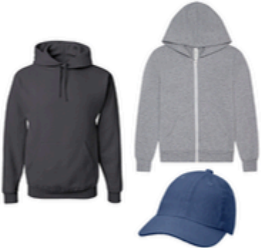
No hats, hooded clothing, or bandanas.