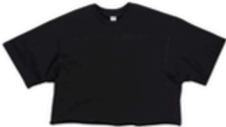
No crops tops or shirts that expose the belly button/skin when arms are raised.