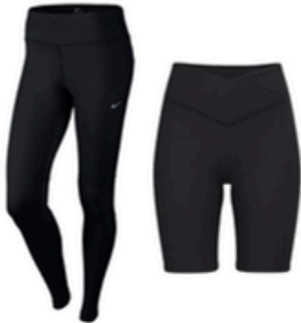
No leggings, yoga pants, spandex, tights, or similar clothing.