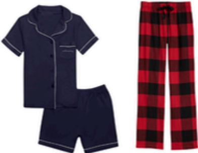
No pajamas or costumes.