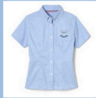
Short Sleeve Oxford Shirt (Womens)

Youth Sizes: 5 - 18 Adult Sizes: S - 2XL