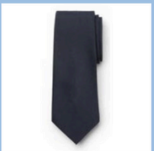
Navy Tie (Unisex) Logic & Rhetoric School Only