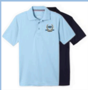
Short Sleeve Sport Polo (Unisex)

Youth Sizes: 5 - 20 Adult Sizes: XS - XL