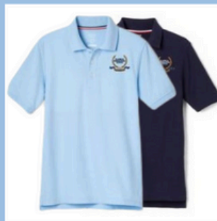
Short Sleeve Pique Polo (Unisex)

Youth Sizes: XS 4/5 - 2XL 20 Adult Sizes: S - XL