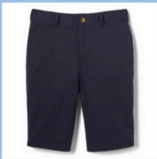
Flat Front Shorts (Mens)

Youth Sizes: XS 4/5 - 2XL 20 Adult Sizes: XS - S Early Academy & Grammar School Only