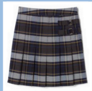
Plaid Two Tab Skort

Youth Sizes: 4-10, 14-18 Adult Sizes: W4 - W16