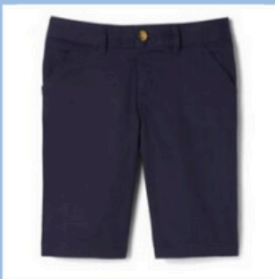
Bermuda Shorts (Womens)

Youth Sizes: 4 - 20 Adult Sizes: 28 - 36