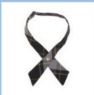
Cross Plaid Tie (Girls) Grammar School Only

Toddler Sizes: 2T - 3T Youth Sizes: 4 - 16 Early Academy & Grammar School Only