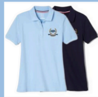
Short Sleeve Pique Polo (Womens)

Toddler Sizes: 2T - 4T Youth Sizes: XS 4/5 - XL 14/16 Adult Sizes: S Early Academy & Grammar School Only