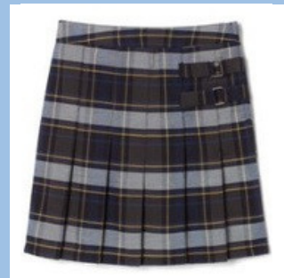
Plaid Two Tab Skort

Youth Sizes: 4-10, 14-18 Adult Sizes: W4 - W16