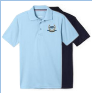
Short Sleeve Sport Polo (Unisex)

Youth Sizes: 5 - 20 Adult Sizes: XS - XL