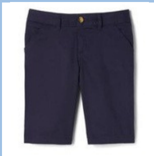
Bermuda Shorts (Womens)

Youth Sizes: 4 - 20 Adult Sizes: 28 - 36