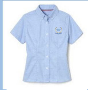
Short Sleeve Oxford Shirt (Womens)

Youth Sizes: 5 - 18 Adult Sizes: S - 2XL