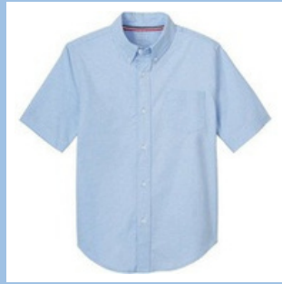
Short Sleeve Oxford Shirt (Unisex)

Youth Sizes: 5 - 18 Adult Sizes: S - 2XL