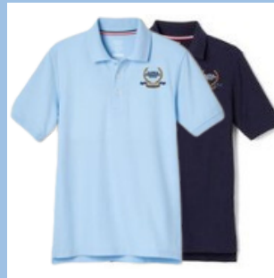
Short Sleeve Pique Polo (Unisex)

Youth Sizes: XS 4/5 - 2XL 20 Adult Sizes: S - XL