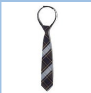
Plaid Tie (Boys) Grammar School Only