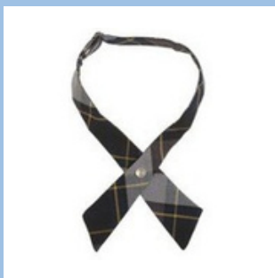
Cross Plaid Tie (Girls) Grammar School Only

Toddler Sizes: 2T - 3T Youth Sizes: 4 - 16 Early Academy & Grammar School Only