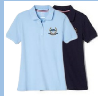
Short Sleeve Pique Polo (Womens)

Toddler Sizes: 2T - 4T Youth Sizes: XS 4/5 - XL 14/16 Adult Sizes: S Early Academy & Grammar School Only