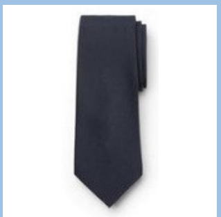
Navy Tie (Unisex) Logic & Rhetoric School Only