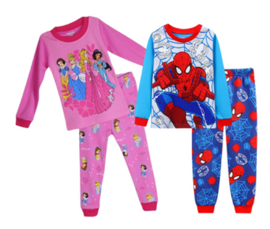
No pajamas or costumes.