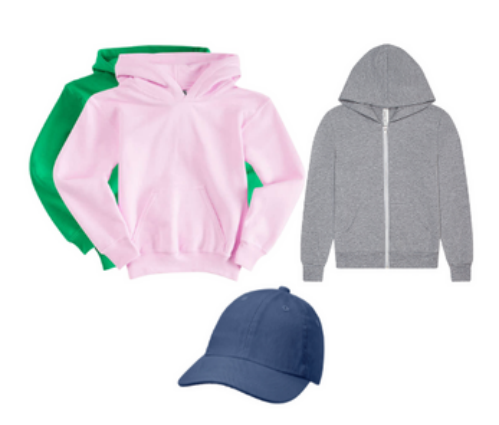
No hats, hooded clothing, or bandanas.