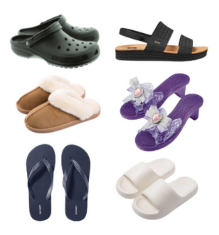
No open toed shoes. No slippers or similar footwear such as Crocs or shoes without backs.