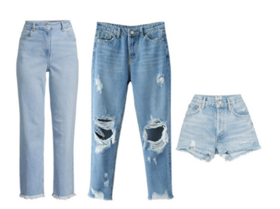
No jeans, pants, or shorts with rips, frayed hems (or edges), or holes. Bottoms can be no shorter than three (3) inches above the knee.