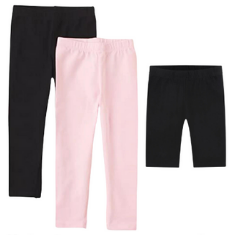
No leggings, yoga pants, spandex, tights, or similar clothing.