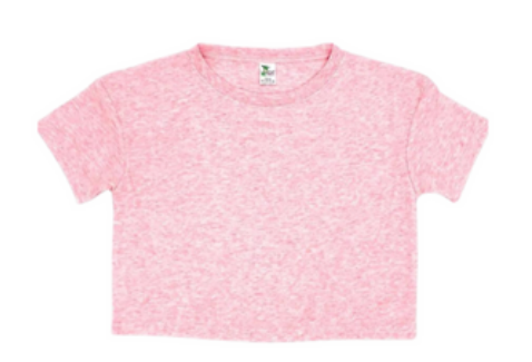
No crops tops or shirts that expose the belly button/skin when arms are raised.