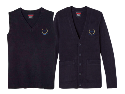
Sweater Vest or Cardigan Optional Item

Must be worn with a uniform shirt underneath Feminine Fit Available