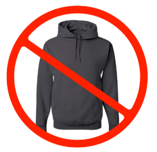
Hooded Clothing (any color)