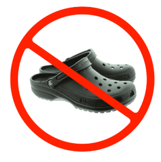
Slide on Shoes (any color)