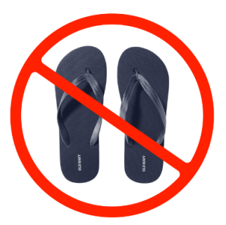
Flip Flops (any color)