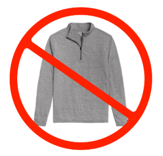
Half-Zip Pullovers (any color)