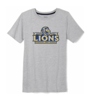
Branded Shirt Color(s): Grey