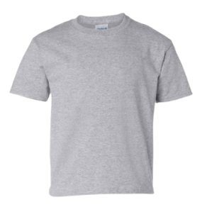
Gildan T-Shirt Color(s): Grey