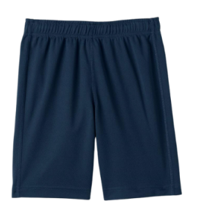
Lands' End or Hanes Mesh Gym Shorts Color(s): Navy