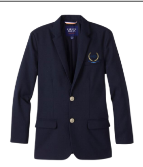
Blazer Optional Item

Short Sleeve Performance Polo Color(s): Blue or Navy