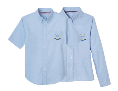
Oxford Dress Shirt Required For Dress Uniform Mondays Can be worn Tuesday-Friday with no tie

Short Sleeve or Long Sleeve Feminine Fit Available Color(s): Blue