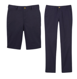
Pants, *Capris, or Shorts

Must be worn with a uniform shirt underneath Feminine Fit Available For Cardigan Color(s): Navy