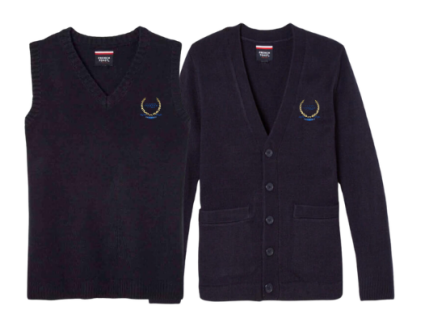
Sweater Vest or Cardigan Optional Item

Must be worn with a polo shirt underneath Grades K-3 Only Color(s): Navy