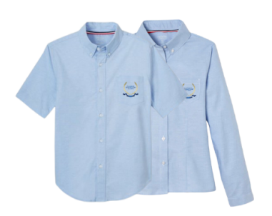
Oxford Dress Shirt

Required For Dress Uniform Mondays Can be worn Tuesday-Friday with no tie