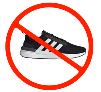
Any shoe that is not solid black