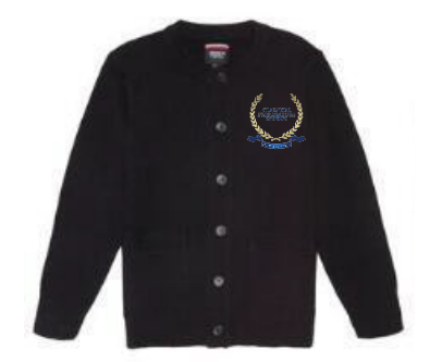
Navy Crewneck Cardigan (Girls) Navy V-Neck Cardigan (Boys)