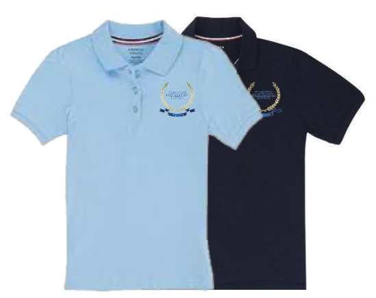
Blue or Navy Pique Polo or Sport Polo (Tuesday - Friday Uniform)