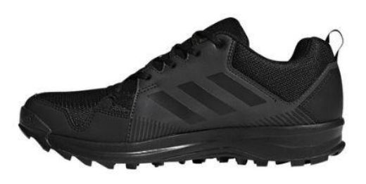
Athletic shoes in solid navy, black, brown or gray.