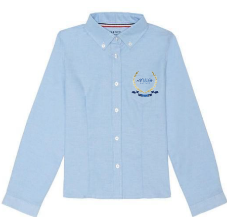
Blue Oxford Dress Shirt (Required For Monday Dress Uniform)