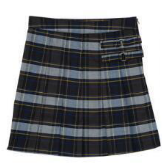
Plaid Two-Tab Scooter Skirt or Plaid Pleated Skirt (Not Shown)