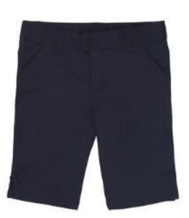
Navy Bermuda Short (Girls) Navy Flat Front Short (Boys)