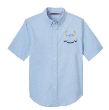
Blue Oxford Dress Shirt (Required For Monday Dress Uniform)